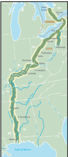
The Underground Railroad Bicycle Route corridor