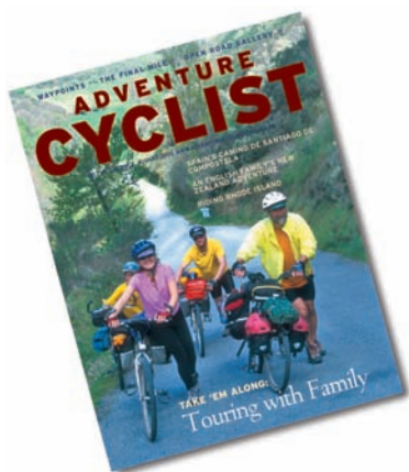
Adventure Cyclist magazine is the premiere resource for bicycle travel.

In fact, 2005 was a milestone year for Adventure Cyclist : We published more total pages (424) than in any previous year, and increased advertising revenue to an all-time annual high of $272,000, allowing us to continue to be the leading authority and voice for bicycle travel. The quality of the magazine's content continued to improve as well, and we added a new category, the photo essay, to the package. Emphasizing imagery over word count, the essays are a new way to convey the wonders of bicycle travel to our readers.